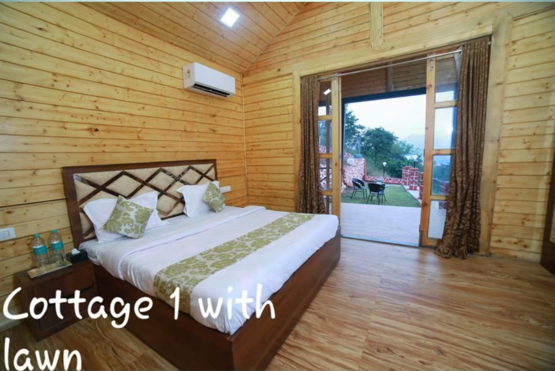
Cottage 1 with lawn