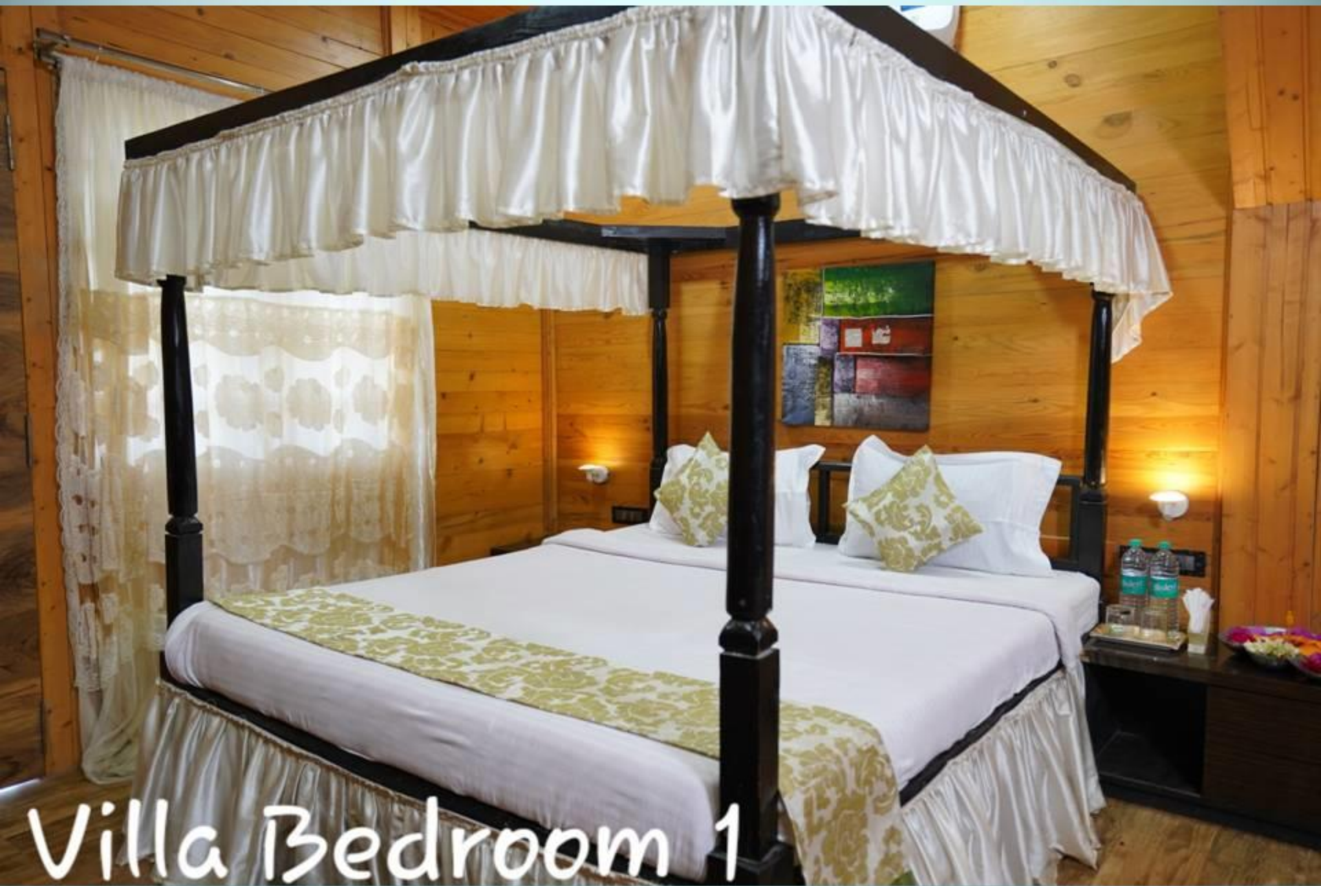
Villa Bedroom 1